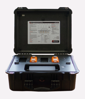
QGM Multi Docking Station