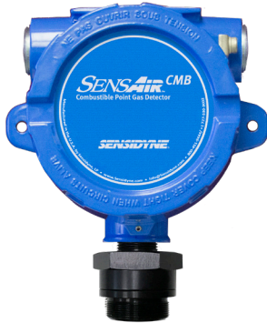
"Blind" version omits local display for cost and company's preference.

SensAir is housed in a rugged explosion-proof enclosure with horizontal or vertical conduit orientation. Display models feature bright LED display and non-intrusive user interface means fast set-up and maintenance. Both the stainless steel and aluminum housing provide excellent corrosion resistance.