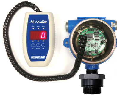
Hand-held Controller (821-0701-01-R) provides local interface for blind (non-display) models.